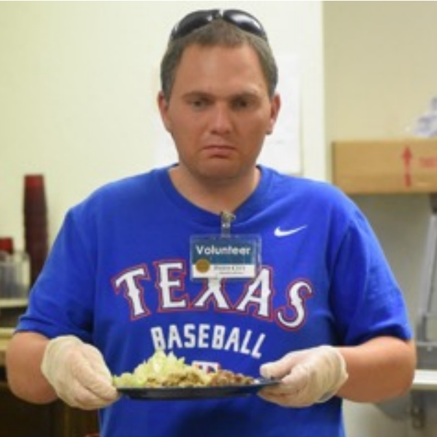
Volunteering at Faith City Mission

“Opening doors of opportunity, and windows of hope!”